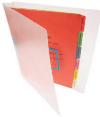
PVC Temporary Files