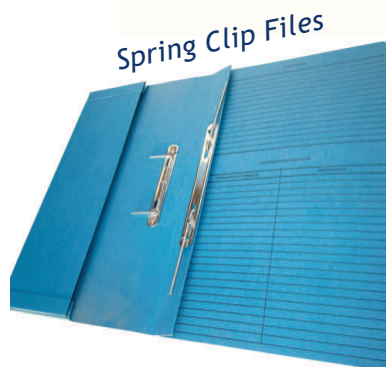
Spring Clip Files