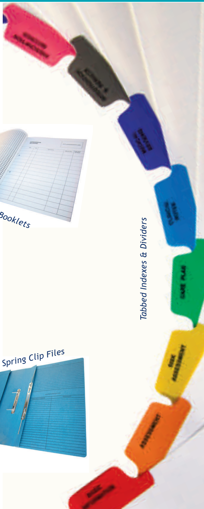
Tabbed Indexes & Dividers

Call Us Now For a Quote on +44 (0) 28 3832 6718 or Email: sales@enterprisestationery.com