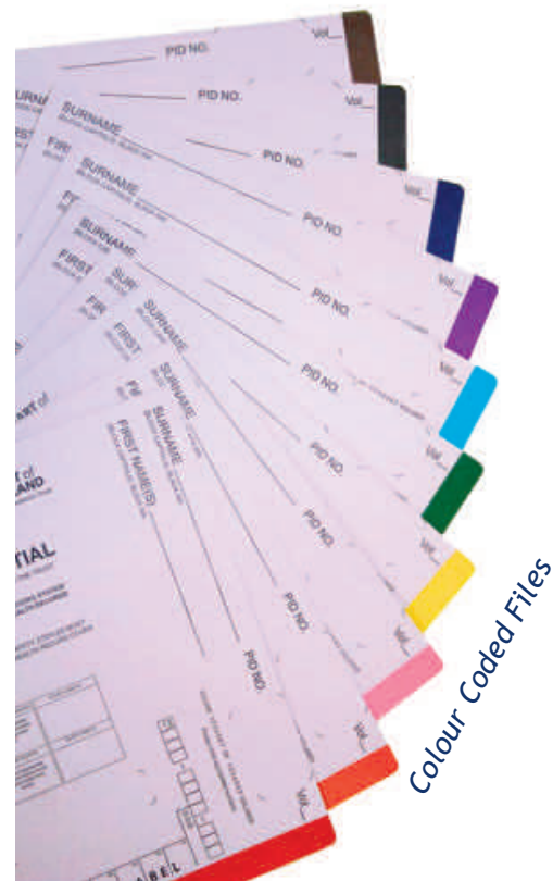
Colour Coded Files